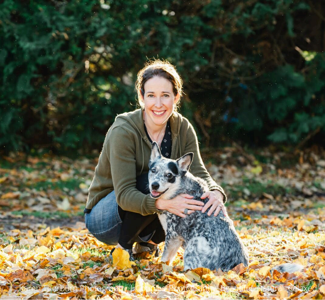
Karen Thorburn Photography | Couples Photography - Beautiful, Natural, Relaxed.